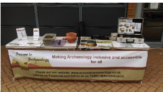
Stall set up for school fetes including our very own trial dig boxes.