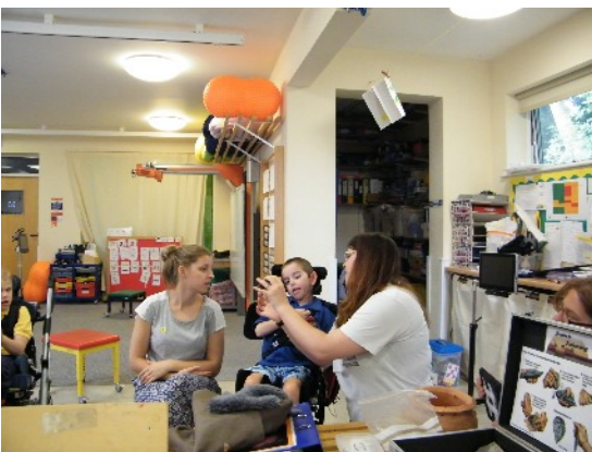
Pace Centre multi sensory introduction to prehistory workshop.