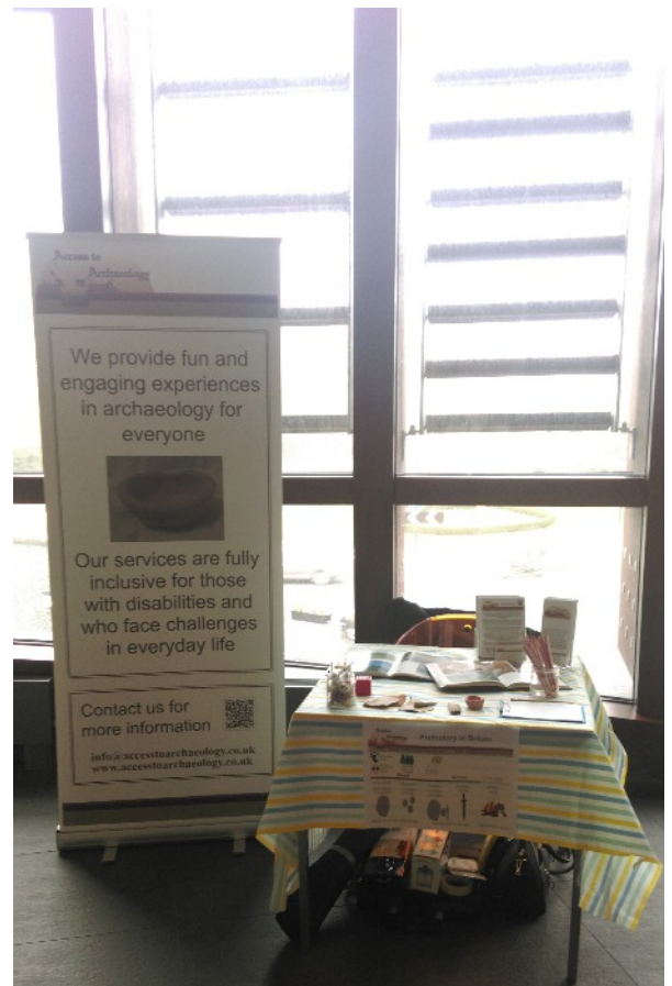
Disability Awareness Day at Waterside Theatre.