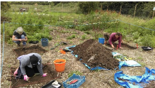
Lindengate Excavation with participants with mental health issues and a gentleman who is totally blind.

In addition to our workshops we run talks and other events throughout the year and can run activities at school fetes and other community events. Have a look below at some of our past events, perhaps your session could appear in the next edition of this workshop guide.